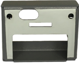
Adaptor plate (supplied with the HPFA products)